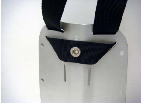
Pic. 3. (back)