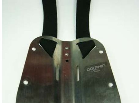
Pic. 4. (front)