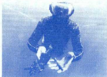
Diver with ship fastening spike and hull sample

Victoria Archaeological Survey 29-31 Victoria Avenue Albert Park VIC 3206 Telephone: (03) 690 5322