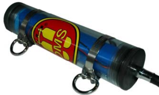
Canister Mounting Hardware: Stainless steel bands with quick links