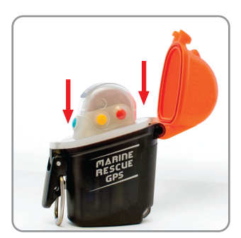
Unscrew two screws on top cap