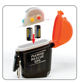
Insert two batteries (Need to install with proper orientation +, - symbols)