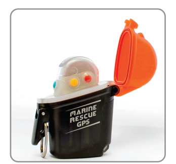
Put screws back