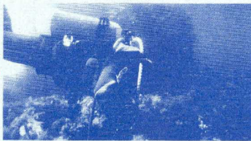
Diver on the Wauchope wreck with the boiler in the background.